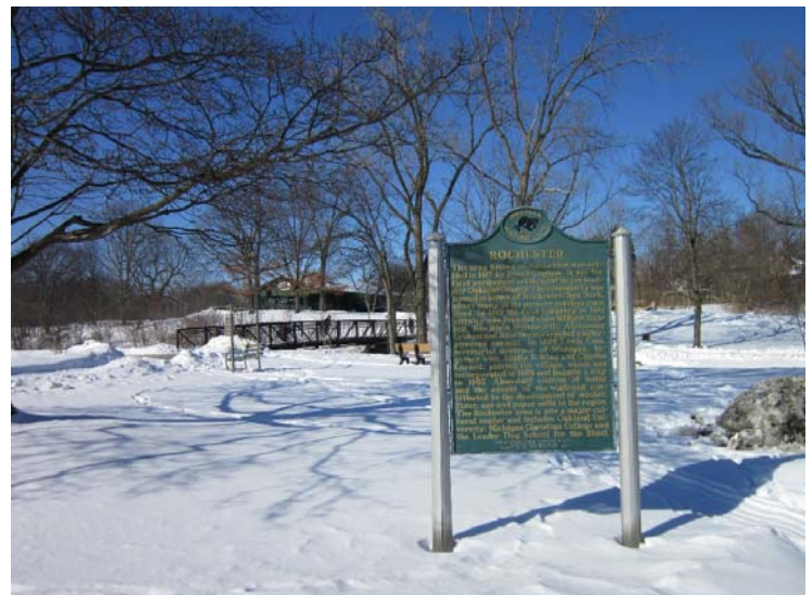
Winter scene in Rochester